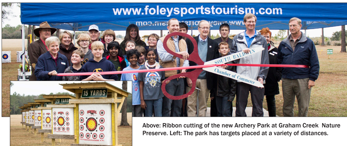
Above: Ribbon cutting of the new Archery Park at Graham Creek Nature Preserve. Left: The park has targets placed at a variety of distances.