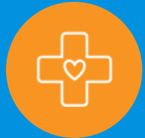
Term Life & Whole Life